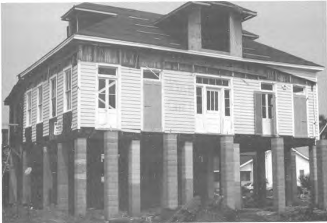
Figure 3. Photograph of a Pre-FIRM structure located on Sullivan's Island, South Carolina which was substantially damaged during Hurricane Hugo. NOTE: The structure is in the process of being repaired and has been elevated to or above the base flood elevation in accordance with NFIP requirements (Refer to Question No. 14).

A. If a substantially damaged structure is located in a coastal high hazard area (V-Zone) it not only must be elevated to or above the base flood elevation, but it also must comply with additional requirements contained in 60.3(e) of the NFIP regulations. These requirements call for the elevation to be on pilings or columns so that the bottom of the lowest horizontal structural member of the lowest floor is elevated to or above the base flood level. This pile or column foundation supporting the structure must also be anchored to resist flotation, collapse and lateral movement due to the combined effects of wind and water loading forces which equal the 100-year mean recurrence interval. Before the permit to repair or rebuild a substantially damaged structure in a V-Zone is granted, a registered professional engineer or architect must develop, review and certify that the structural design, specifications and plans for the construction are in accordance with accepted standards of practice for meeting the above requirements for V- Zone foundations and anchoring.