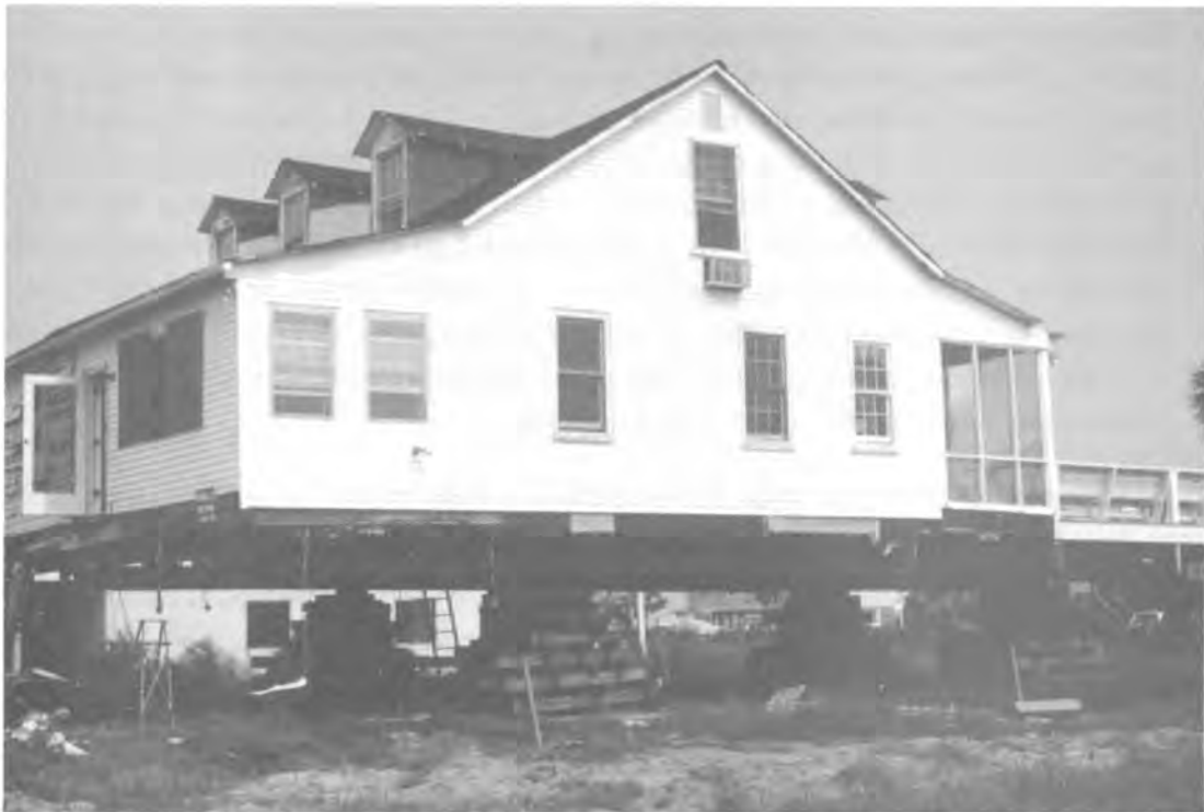
Figure 1. Photograph of a Pre-FIRM structure located on Sullivan's Island, South Carolina which was substantially damaged during Hurricane Hugo. NOTE: The structure has been repaired and is in the process of being elevated to or above the base flood elevation in accordance with NFIP requirements for substantial improvement (Refer to Question No. 9).

FEMA has established a procedure for the flood insurance policies directly written by the NFIP called Post Flood Underwriting. Under this procedure, if a building claim is 50 percent or more of the building's value, the claim is referred to the NFIP's underwriters. At renewal time, the policyholder must submit a new flood insurance application with a elevation certificate. The building is then rated as a Post-FIRM building. The Write Your Own (WYO) Companies that participate in the NFIP are required to have similar underwriting procedures.